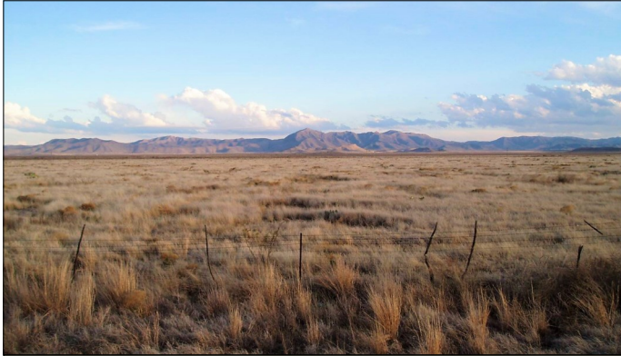
The Center for Land Stewardship and Stakeholder Engagement is a new resource in the Chihuahuan Desert of West Texas. The center provides science-based guidance for achieving conservation goals and serves as a liaison for landowners, industry, and community members.

T he Center for Land Stewardship and Stakeholder Engagement has been established at the Borderlands Research Institute (BRI) at Sul Ross State University. The new center facilitates conservation efforts in far West Texas by providing technical resources for landowners, energy developers, community members and conservation partners.