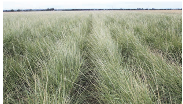
Once the evaluation process is completed, select populations are released to commercial seed companies.

We utilize the original seed for establishing seed increases because we want to maintain the genetic integrity of the wild population as much as possible. Seed harvested from these fields is provided to cooperating commercial seed dealers, who then plant larger fields. Seed harvested from the commercial increase sites will eventually make its way to consumers as a selected native germplasm.