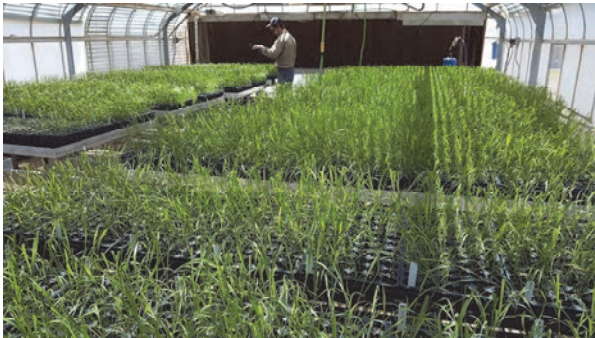
Species selected for evaluation are first grown in a greenhouse before they are evaluated in the field.

After seed is collected, it is cleaned, cataloged, and then placed in cold storage. When a reasonable number of seed collections have been made for a plant species (e.g., collections obtained are representative of the diversity of the species' occurrence and range), the evaluation process begins. A small portion of the original seed collections of each species is propagated in a greenhouse. Seedlings are then transplanted into field research plots and evaluated over time by several criteria including seed germination, seed production, growth rate, biomass production, and survival.