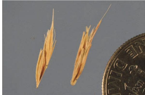
Sideoats grama is found throughout United States, but only seeds from local populations will consistently persist and reproduce over the long term.

Native seed can be hard to come by, sometimes because consumer demand often exceeds producer supplies. As a result, exotic grasses are often planted to prevent soil erosion in reclamation projects or following habitat improvement efforts. However,