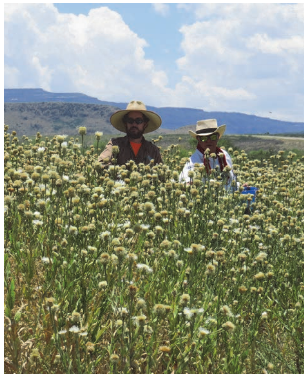
Researchers with West Texas Native Seeds work to collect seeds from American basketflower in Jeff Davis County.

Working with private landowners, we have made over 900 seed collections of 116 plant species from across West Texas.