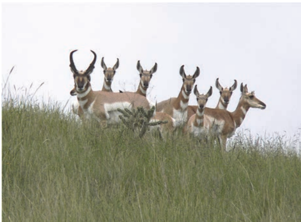
Desert grasslands provide an abundance and diversity of native plants for many wildlife species.

West Texas Native Seeds is a multi-agency collaborative project to provide native seeds for the restoration of wildlife habitat and disturbed lands across West Texas. The project is a joint initiative of the Borderlands Research