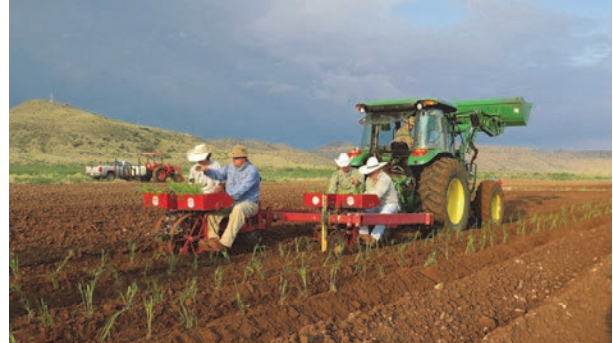
Researchers use traditional farming techniques to grow native plants during the increase phase.

Once the populations for a release are identified, the original collections of those populations are used to establish seed increase fields.