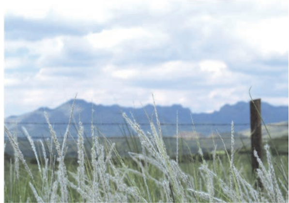
West Texas Native Seeds is a collaborative effort between the Borderlands Research Institute and Caesar Kleberg Wildlife Research Institute.

West Texas Native Seeds is modeled after the Kleberg Institute's successful South Texas Natives project. Over 30 native seed sources have been developed for South Texas in the last decade through the South Texas Natives project. These efforts have resulted in the