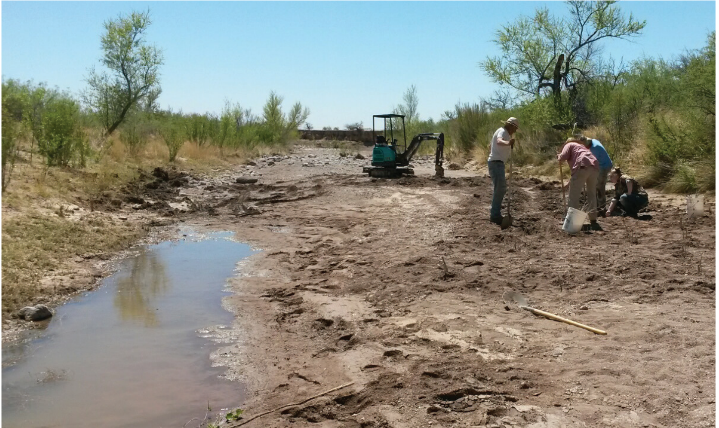
Sul Ross students plant willows and cottonwoods in Terlingua Creek.

Survival was highest with late spring planting. For cuttings, planting must be done in early spring. This can decrease the good planting habitat area as the riparian water table can be at its lowest in the spring prior to the monsoon season.