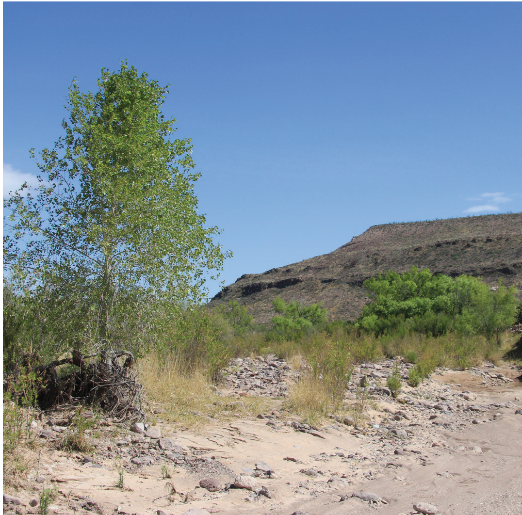
A cottonwood that is approximately 8 years old, grown from seed, with a row of pole cuttings of willows less than 2 months old.

The second technique creates clones of a cottonwood tree from cuttings. This is a great technique to quickly establish trees but you must be cognizant of the