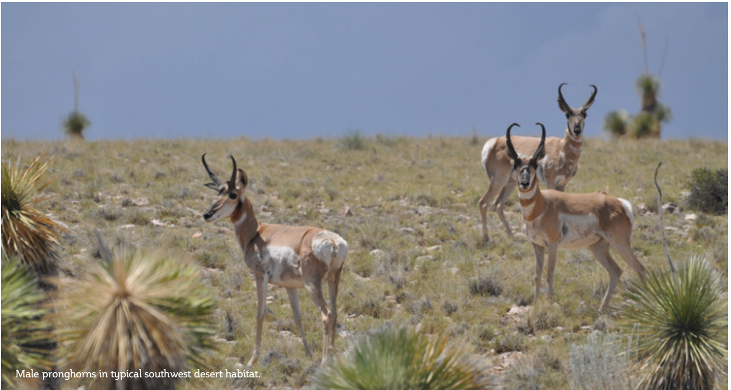
Male pronghorns in typical southwest desert habitat.

P ronghorns have accrued a variety of different names over the years, including prong buck, cabri (Native American), speed goat or simply antelope. Although it is commonly claimed that pronghorns are the only North American species of antelope, the name antelope is somewhat of a misnomer. Pronghorns are, in fact, not true antelope; but, then again, they're not deer either. But if they're different from antelope, why do we call them antelope? Well, pronghorn are often mistakenly designated as antelope, because they resemble the true antelope