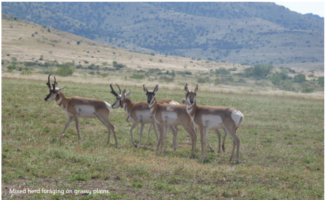
Mixed herd foraging on grassy plains.

Apart from the digestive adaptations, pronghorns are built for speed. Pronghorns can run exceptionally fast, and they are built for maximal predator evasion through run-