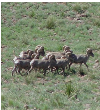
Dedication of landowners, biologists, and volunteers has paid off for desert bighorn sheep. Their populations have increased from 0 in the 1960s to over 1,200 today.