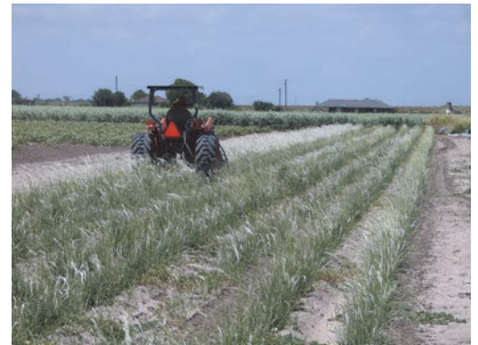
The Trans-Pecos Native Plant Materials Initiative will provide a commercial source for native seeds for habitat restoration, reclamation, and re-vegetation purposes.

A critical part of the seed development process is the collection of multiple popula-